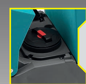
LARGE CAPACITY SOLUTION TANK The tank has a capacity of 120 litres, expandable up to an impressive 360 litres with the activation of the ECOsystem®. Convenient access to the solution tank allows for easy filling, as well as complete inspection and maintenance.