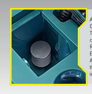
AUTOMATIC SANITATION OF THE ECOSYSTEM® Thoroughly and effortlessly sanitize the ECO circuit RECOVERY TANK EASY TO CLEAN AND MAINTAIN. A large porthole facilitates the easy cleaning of the recovery tank, including the discharge of sludge.